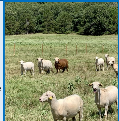
Ram and ewes on pasture

Fall lambing is coming up fast with a large roster of soon-to-be moms. The crew used ultrasound technology to determine pregnancy for animals bred for fall which resulted in 115 ewes bred with an excellent conception rate of 91% for mature ewes. Breeding for fall lambing can be tricky as it is considered out-of-season for most ewes. At the research center, Dr. Burke has developed a very successful breeding program which includes exposing ewes to teaser rams approximately 14 days prior to introducing intact breeding rams and using multiple sires. A teaser ram is a ram that has been vasectomized but maintains his testosterone levels and libido. The introduction of teasers stimulates ewes to begin their cycle so that when intact rams are introduced ewes are more likely to conceive. After the teasers are removed, multiple sires are added to the breeding groups at a ram/ewe ratio of 1:20-25. Due to using multiple sires, a DNA sample is submitted to determine sire. The sample is also used in the 50K SNP genotyping for NSIP, contributing to the growing reference population of more than 10,000 samples in the Katahdin breed with matching performance records. To learn more about the 50K SNP genotyping refer to the February 2022 newsletter article about Genomic Enhanced Estimated Breeding Values.