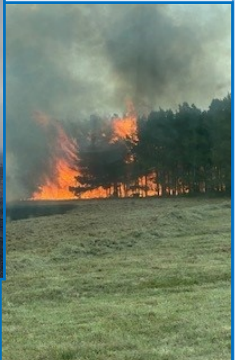
Battling wild fire!